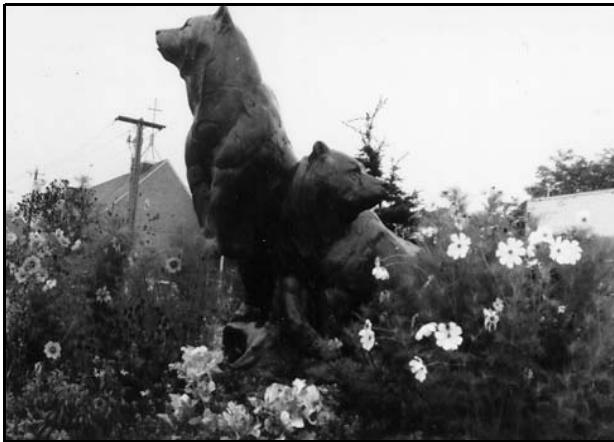
Public art in Downtown Kirkland

the aspirations and values embodied in the Vision Statement. By nature they are forward-looking and future-oriented. Even so, they were developed with a keen awareness of Kirkland's history and a strong appreciation for the high quality of life which that history has given us. The Framework Goals address a wide range of topics and form the foundation for the goals and policies contained in other elements of the Comprehensive Plan. Although all of the Framework Goals broadly apply to all Comprehensive Plan elements, some of the Framework Goals are more applicable to some elements than others. Each element identifies the Framework Goals that are particularly relevant to that element.