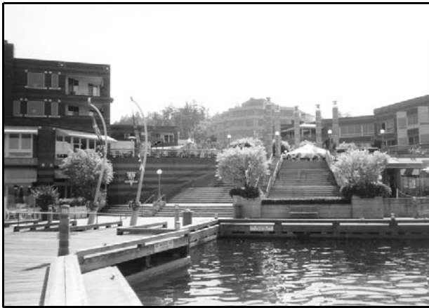
Carillon Point public access areas

Discussion: Kirkland's economy provides a variety of employment opportunities, a broad range of goods and services, and a strong tax base. We are fortunate to have a diversity of successful business sectors, including retail services, offices, industrial and high technology companies, medical and educational institutions, and home-based businesses. A large number of creative and innovative entrepreneurs are attracted to Kirkland by our many cultural, recreational and civic activities and our beautiful setting.