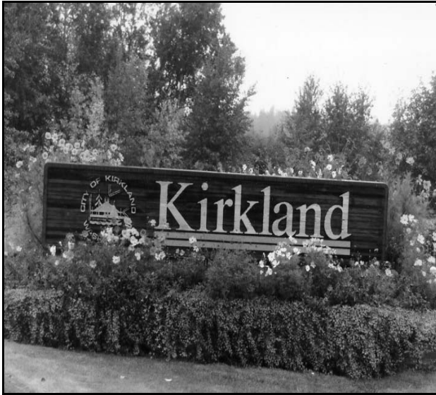
Welcome to Kirkland sign

The Vision Statement is a verbal snapshot of Kirkland in the year 2022. It summarizes the desired character and characteristics of our community. It provides the ultimate goals for our community planning and development efforts.