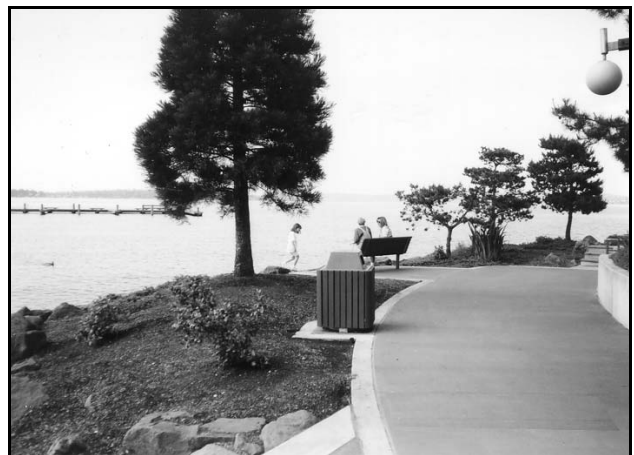
Marina Park in Downtown Kirkland

FG-11: Maintain existing park facilities, while seeking opportunities to expand and enhance the current range and quality of facilities.