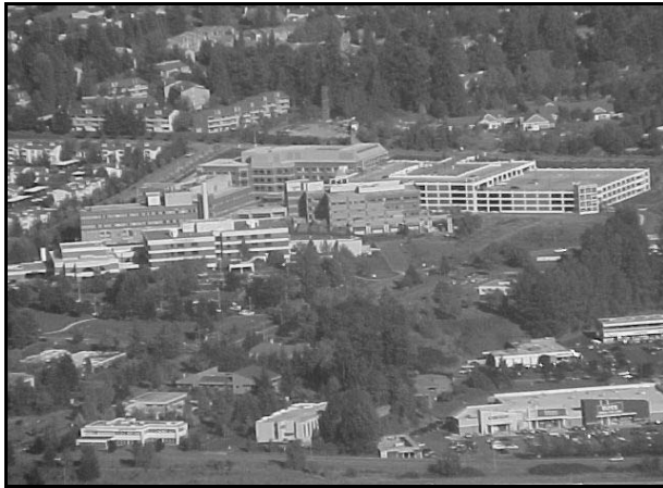
Evergreen Health Care Center